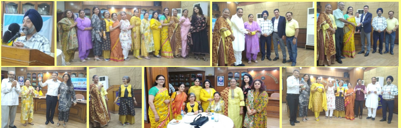
Some colourful glimpses of the meeting. For more click here to see on Facebook